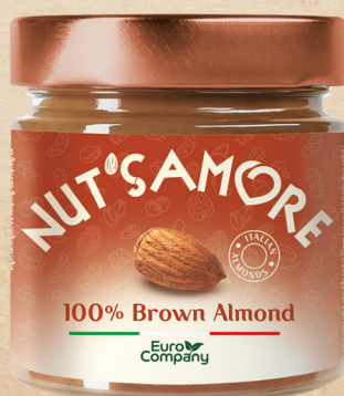
Brown Almond 175 g - 300 g

Delicate taste with a subtle bitter note, preserving the natural sweetness of almonds.