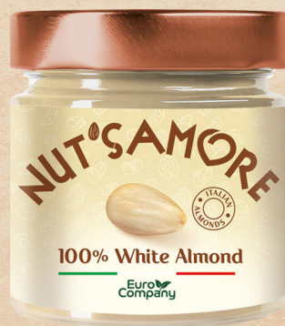
White Almond 175 g - 300 g

The rich flavor of pistachios enhanced by the pleasantly bitter notes of Italian almonds.