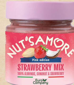
Strawberry mix 175 g - 300 g

Almonds and hazelnuts bring a delicate richness to this blend, perfectly balanced by the bold, roasted character of peanuts.