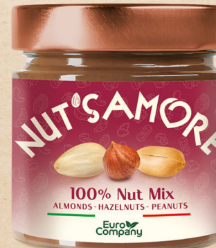
Nut mix 175 g - 300 g

Almonds and hazelnuts bring a delicate richness to this blend, perfectly balanced by the bold, roasted character of peanuts.