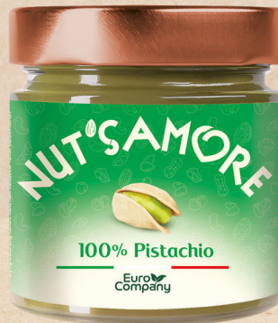
Pistachio 175 g - 300 g

Characterized by a delicate aroma, a naturally rich cashew flavor and an exceptionally smooth, creamy texture.