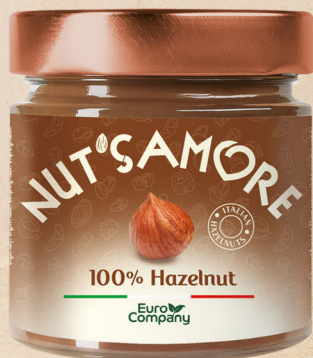
Hazelnut 175 g - 300 g

Aromatic scent, characteristic of Italian hazelnuts, with an intense flavor and a silky smooth texture, ideal for use as a topping.