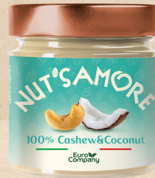
Cashew & Coconut 175 g - 300 g

An exceptional blend of the rich flavor of hazelnuts and the natural sweetness of dates, offering a unique and harmonious taste.