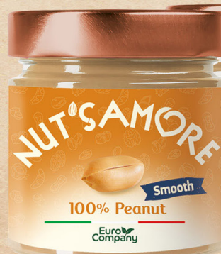
Smooth & Crunchy Peanut 175 g - 300 g

A bold and persistent flavor that showcases the typical taste of roasted almonds, with a smooth, easy-to-spread texture.