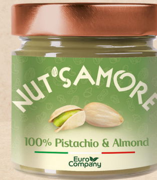
Pistachio & Almond 175 g - 300 g

The boldness of coconut enhances the natural delicacy of cashew spread, creating a unique explosion of flavor.