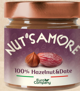
Hazelnut & Date 175 g - 300 g

An intense and enveloping flavor, made even more irresistible by its smooth and velvety texture, making this cream a truly unique experience.