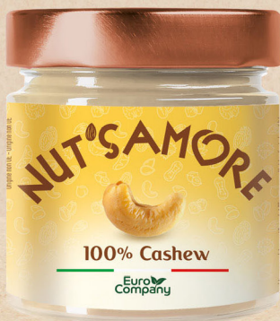
Cashew 175 g - 300 g

Aromatic scent, characteristic of Italian hazelnuts, with an intense flavor and a silky smooth texture, ideal for use as a topping.